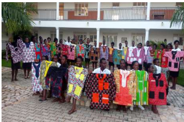
Students displaying their garments

" Dear St Francis, I write just a few lines to let you know how thankful I am to you. Thank you very much for the sponsorship you offered me. If it had not been for your