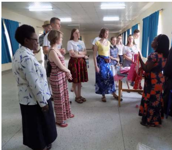
Nangina Group members being shown garments made by students of St. Francis Tailoring school.

Many good things, events, people have entered our lives in the last year and we will mention some of them here, although whenever one starts naming names, there is almost always someone or some group which will have been left unmentioned and so we take that risk but do not wish to neglect any of our supporters in any part of the world.