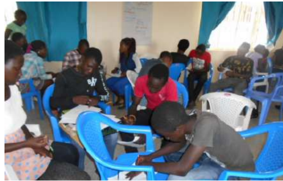
Children spent many hours at St. Francis sharing and studying in groups

nothing so precious I can give you but just this gift of a bag, it is small but full of love. I promise to always pray for you. Lastly, I will always remember you. Thank you!"