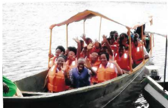
Students enjoying a boat trip on the River Nile.

We started the year with 80 students, 45 in first year and 35 in second year. 35 students