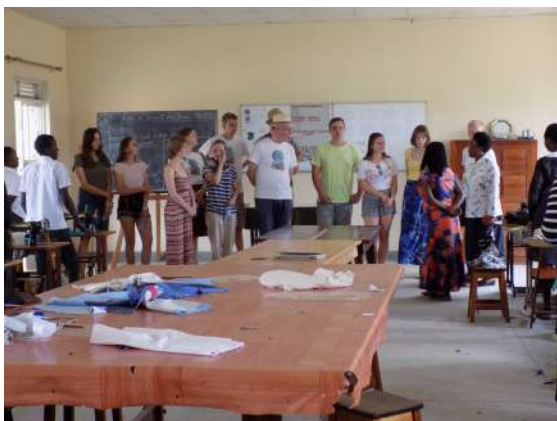
Nangina Group members in the tailoring school