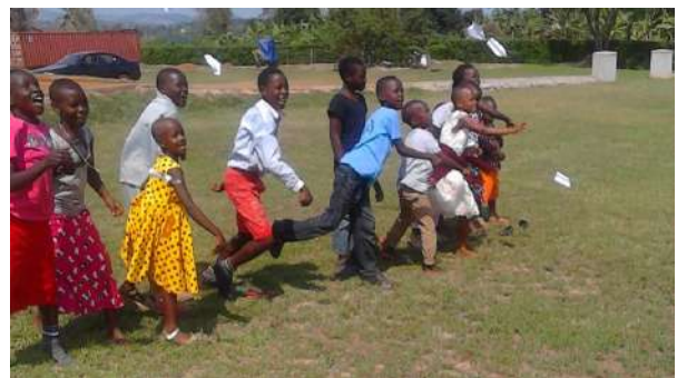
Play activities were organized for children in lower primary to help them relax during the short holidays.

During holidays, all our sponsored children meet at St. Francis, and we have different activities organized for them. They get a chance of knowing each other as one family. We would like to express our appreciation to