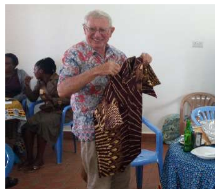
The tailoring department made a shirt for him and he likes it