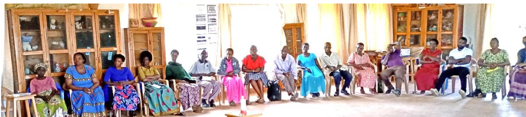
Parents of Sponsored Children coming for a training on Stages of Child Development