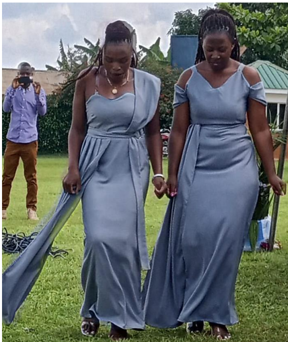
Students modeled their final examination garments

21 male and female students graduated with two Certificates, one from the Ministry of Education and one from the Institute. Sue Horrocks was the guest of honour and handed out the certificates.