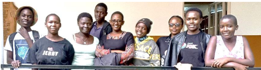
Some of our sponsored boys and girls

There is ALWAYS someone whose life you can improve if you just look and listen. There is always someone to whom you can offer compassion and encouragement. We always have the poor and hungry with us. We need not fear not finding a way to make the world a better place.