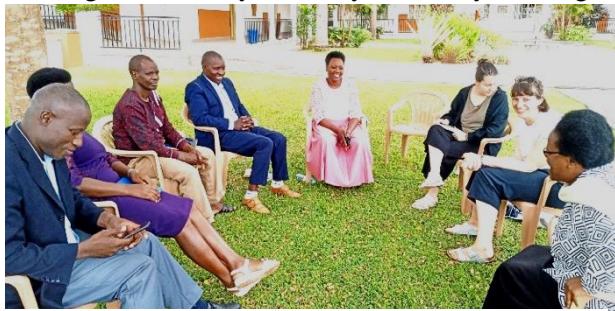
Meeting with the head teachers and their wives from the schools trained in Rubirizi and Ntungamo districts.

During their visit, which for them was both a “come and see” visit as well as an assessment and evaluation of activities which they have been funding for several years, they had many meetings.