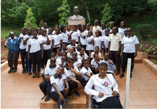
On a trip to the source of the Nile in Jinja

Currently, the institute has 72 students on the full