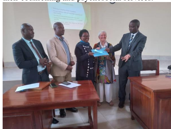
An MoU between Government Leaders and St. Francis as the Misereor project enters a new district to work for three years.

The Misereor funded project works with parents/couples to help them deal with the big issues which cause much suffering: little or no dialogue and communication between spouses, gender inequality, unequal distribution of family resources, of labour in the home, violence, alcoholism, hierarchical decision-making and parent/child conflict. At the end of 3 years evaluations are carried out and these clearly show enormous changes in family situations. The work is very demanding and all facilitators have experienced burnout in the constant demand for their counselling and psychosocial services.