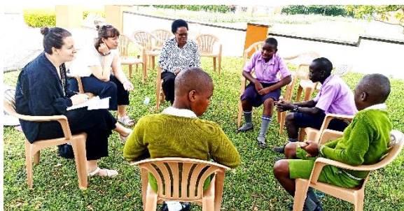
Meeting with some of the children from primary schools where teachers had been trained. The children spoke of the many changes in the behaviours of the teachers.

They held meetings with various other stakeholders; children being sponsored by St. Francis and Kindermissionswerk, some of the 800 teachers who were trained from schools of Ntungamo and Rubirizi, parents whose children attend the above schools, facilitators who give the training to teachers and the administrative staff of St. Francis FHP. Next year the project will move to two new districts of Mitooma and Isingiro.