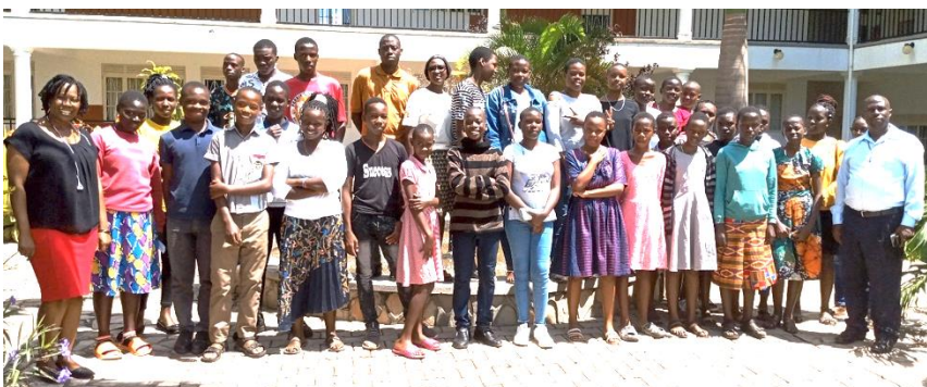
Sponsored Children on a holiday workshop on how to set and achieve goal

Thank you again to all of you who have made the world of many Ugandans a better place. Thank you for continuing to support us.