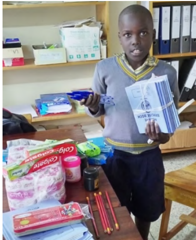
Receiving some school materials from the office

Furthermore, because of COVID, some of our