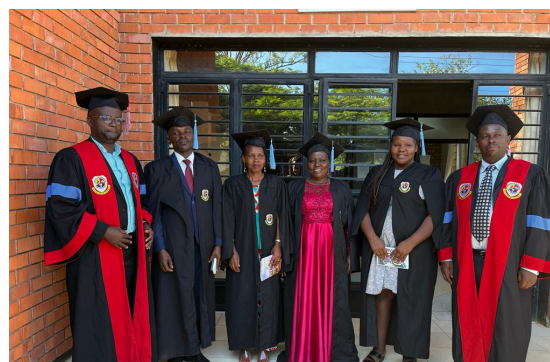
Diploma Graduates, now studying for BSc

Last year we also explained, that due to COVID and the mandated closure of our Institute, none of our students were able to graduate with a diploma or degree in Counselling Psychology. It is against this backdrop that we rejoiced greatly when 5 of them came back, completed their requirements and graduated from Uganda Martyrs University in November, 2022, one with a Degree and four with a Diploma.