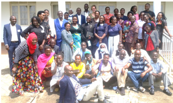
Development Workers training in St. Francis

St. Francis CTI employs a number of full-time as well as external/part-time staff sometimes in projects to carry out training in Personal and Group Transformation and Participatory Adult Learning Methods in different parts of the country.