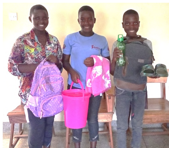
Children showing what they bought with gift money

The child sponsorship department is the oldest department and the only one that existed for many years. In fact, St. Francis project was founded in 1984 to find money for the education of the most disadvantaged children. At that time, we were paying school fees for over 300 children and secondary school fees cost 50 pounds per year. Now we have only 63 children in the programme.