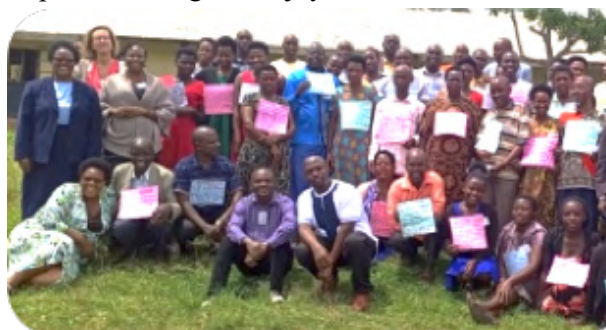
Some of the 720 teachers being trained by St. Francis in this present phase. They are holding a paper on which they have written personal commitments to live their lives with integrity and other values each one has selected

They beat children because they believe it is the best way to teach them how to obey and conform. Once they are exposed to the fact that beating and verbally abusing children can cause severe trauma and lead to low self-esteem and poor performance they change quickly and regret the harm they might have inadvertently caused. The teachers wholehearted positive response is our greatest joy and reward.