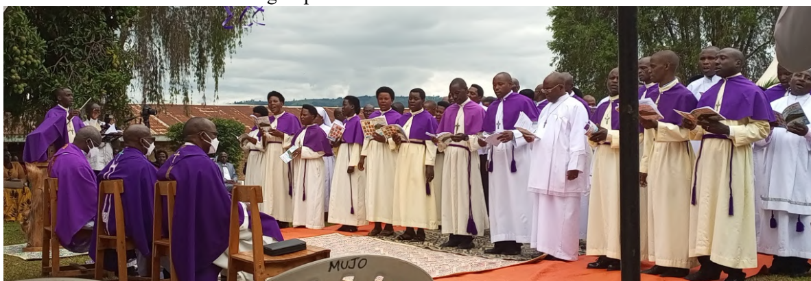
Commissioning Catechists at St. Kalembe's Catechetical Training Centre, Ibanda, at the end of a 2-year Training

needs. The training lasts for 20 days and introduces the catechists to the practice of self-reflection, mindfulness exercises, personal empowerment, gender issues and many other relevant topics. The personal empowerment training invites catechists to realise that the individual Christian, can make his/her own decisions in relating to God as otherwise they may think that they, the Catechists, have power over the decision-making of Christians. Gender training helps to break the cultural belief that men are more entitled than women. In addition to training the beginner catechists, St. Francis also goes out to parishes when invited by the parish priests and gives a training of 20 days to working catechists and their spouses. If their lives are improved because of the training, they carry out better work in the parishes with Christian communities.